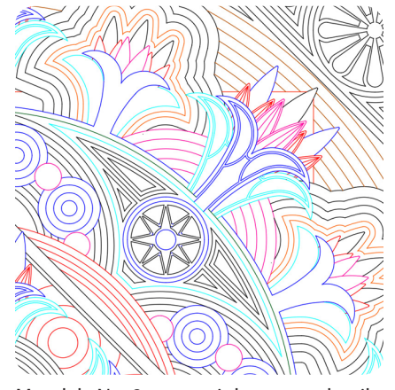
Mandala No. 8, upper right corner detail.