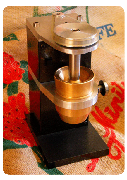
The M3 Grinder's revolutionary design eliminates all residual grounds so there are no oxidized remains from previous grindings.

For the next version of the M3, Bicht is moving from Graphite to Xenon. He will start generating interest among coffee connoisseurs using photo-realistic renderings prior to ever building a physical prototype. Says Bicht, "Ashlar-Vellum allows us to make the M3 Espresso System the most amazing espresso equipment anywhere in the world."