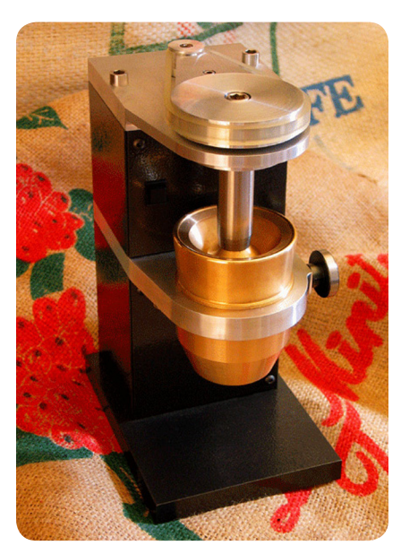
The M3 Grinder's revolutionary design eliminates all residual grounds so there are no oxidized remains from previous grindings.

For the next version of the M3, Bicht is moving from Graphite to Xenon. He will start generating interest among coffee connoisseurs using photorealistic renderings prior to ever building a physical prototype. Says Bicht, "Ashlar-Vellum allows us to make the M3 Espresso System the most amazing espresso equipment anywhere in the world."