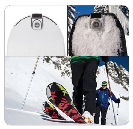
Montana International's new ski piercing fasteners easily secure climbing skins to any shape of ski or splitboard tip.

"For modelling and 3D printing I use only Cobalt, of course, because I need to make the STL files and I can only do it in Cobalt. And then when it comes to detailing I use Graphite. I still like the 2D part of Graphite. I'm an old Vellum® user. The flexibility for me is the best part."