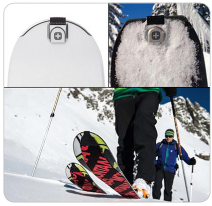
Montana International's new ski piercing fasteners easily secure climbing skins to any shape of ski or splitboard tip.

"For modeling and 3D printing I use only Cobalt, of course, because I need to make the STL files and I can only do it in Cobalt. And then when it comes to detailing I use Graphite. I still like the 2D part of Graphite. I'm an old Vellum® user. The flexibility for me is the best part."