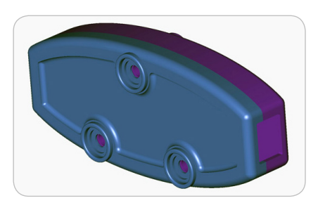
The rear sleeve (above) and knuckle (below) were modelled in Xenon by Steven Reiss as part of the design modifications for the dog wheelchairs.